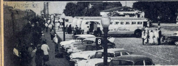
To Ticket Agents, Travel Agents and Our Patrons; Passengers:

East Los Angeles Station, with waiting rooms and public conveniences, serves as a transfer station for Union Pacific passengers, via motor bus to and from Pasadena, Glendale, Disneyland Hotel, Anaheim and Long Beach-San Pedro Branch Line points.